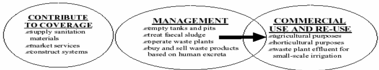
Figure 2. From coverage to commercial re-use – the road to sanitation based livelihoods

After the many failures in sanitation, the agenda has changed!